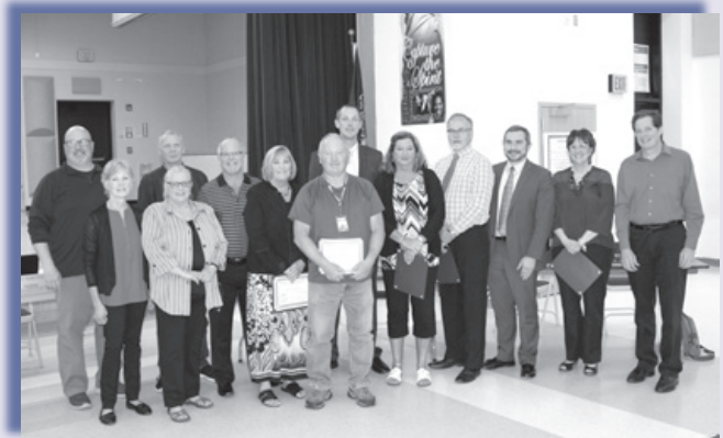
Pictured above are BOE members and retirees who attended the Retiree Recognition Ceremony held during the June 5 Board of Education meeting.